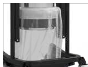
MAXIBAG COLLECTION SYSTEM