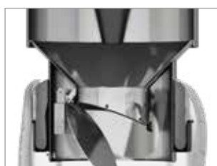
SELF DISCHARGE VALVE